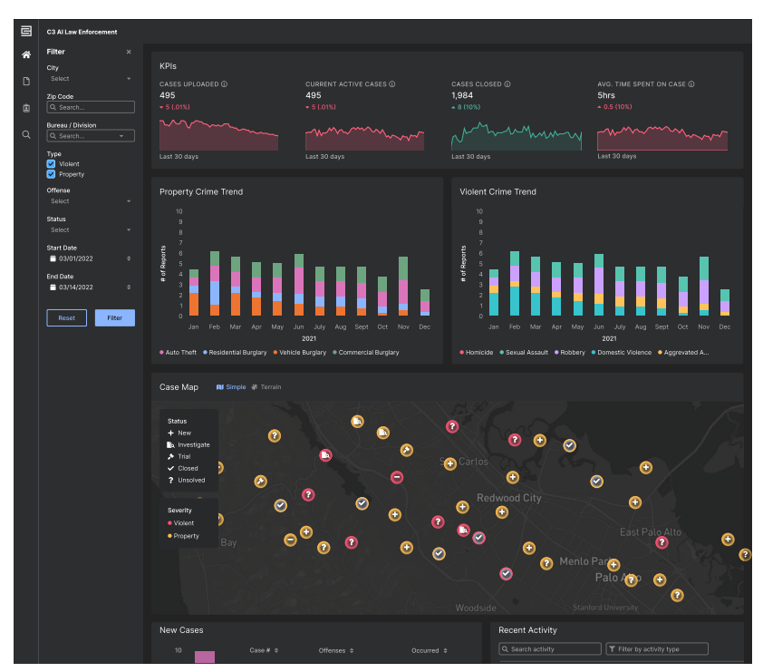
Figure 1. C3 Al Law Enforcement provides a single dashboard for the most critical information.

C3 Al Law Enforcement presents a comprehensive set of capabilities in a user-friendly interface. The application enables users to efficiently aggregate, access, explore, annotate, and analyze structured and unstructured datasets to derive insights.